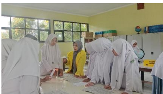
Fig 3. Syntax Answer Activities (practicum)

The measuring skill in the experimental class was trained during the "answer" syntax, by applying the practical method. In this syntax, students are directed to design and conduct the practical session directly in the laboratory. During this syntax, the teacher guides and directs the students in determining the tools and materials, as well as the steps of the practical session to be carried out. This practical session is conducted to answer the questions given in the "read" syntax and to train the students' measuring skills.