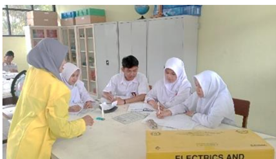
Fig 6. Syntax Create Activity

The mastery achievement of students in the concluding skill reached 83% in the experimental class, categorized as high, and 75% in the control class, categorized as fair. The concluding skill of students in the experimental class was trained during the "create" syntax. In this syntax, the teacher directs and guides the students to create a practical report on a folio paper. Then, the students create their practical reports according to the systematic guidelines determined by the teacher. The systematic report includes objectives, materials and methods, experimental procedures, observation data, data analysis, and conclusions. In the final part of the report, the conclusion is presented, where students learn to draw conclusions from the practical results and discussions conducted in the previous syntaxes. The activities in the "create" syntax in the experimental class are depicted in Figure 6.