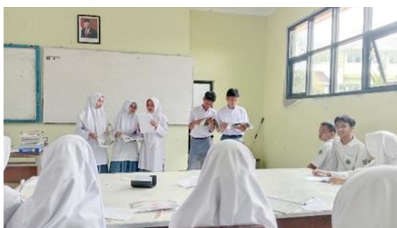
Fig 5. Syntax Explain Activity

The mastery achievement of students in the concluding skill reached 83% in the experimental class, categorized as high, and 75% in the control class, categorized as fair. The concluding skill of students in the experimental class was trained during the "create" syntax. In this syntax, the teacher directs and guides the students to create a practical report on a folio paper. Then, the students create their practical reports according to the systematic guidelines determined by the teacher. The systematic report includes objectives, materials and methods, experimental procedures, observation data, data analysis, and conclusions. In the final part of the report, the conclusion is presented, where students learn to draw conclusions from the practical results and discussions conducted in the previous syntaxes. The activities in the "create" syntax in the experimental class are depicted in Figure 6.