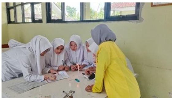
Fig 4. Syntax Discuss Activity

discussion syntax, to present their group discussion results in front of the class. Other groups of students pay attention to their classmates' presentations and provide questions/statements regarding their classmates' presentation. Then, the teacher reinforces the students' presentation results and explains the material to be conveyed during that session. The activities in the "explain" syntax in the experimental class are depicted in Figure 5.