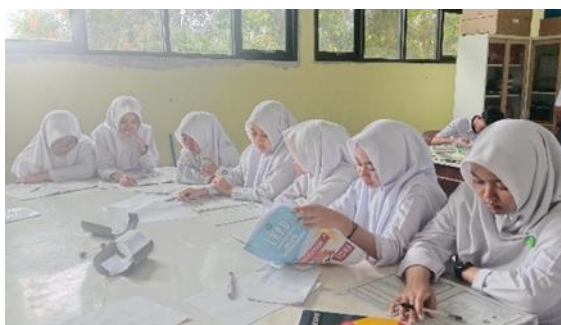
Fig 2. Activity Syntax Read

Furthermore, the measuring skill in the experimental class reached 89%, categorized as high, while in the control class it reached 85%, also categorized as high. The measuring skill achieved the same category in both the experimental and control classes. This occurred because both classes conducted the same activity, which was a practical session using the same objectives and materials. According to Sampurna & Nindhia [16] similar activities yield similar or nearly similar results. However, there is a difference in the treatment of students in the experimental class, where they are guided by the teacher to design the practical session independently, while in the control class, the teacher provided a list of materials and equipment, as well as the steps of the practical session to be carried out.