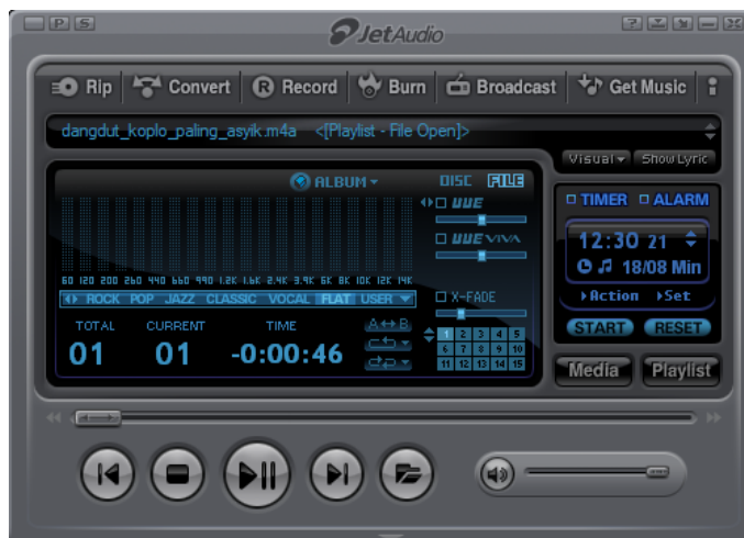
Fig 1. Display of jetAudio software