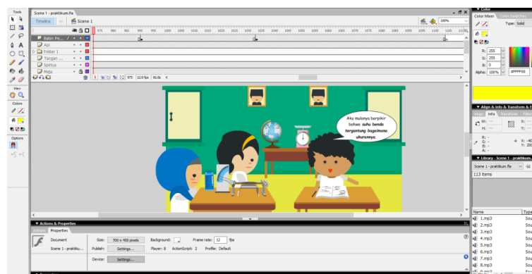
Fig 3. DSCC example in Indonesian version

In order to facilitate the researcher, as the following are the sequences of questions for the sciences teacher. The example teachers' responses had given for implementation of DSCCs were shown in Table 5.