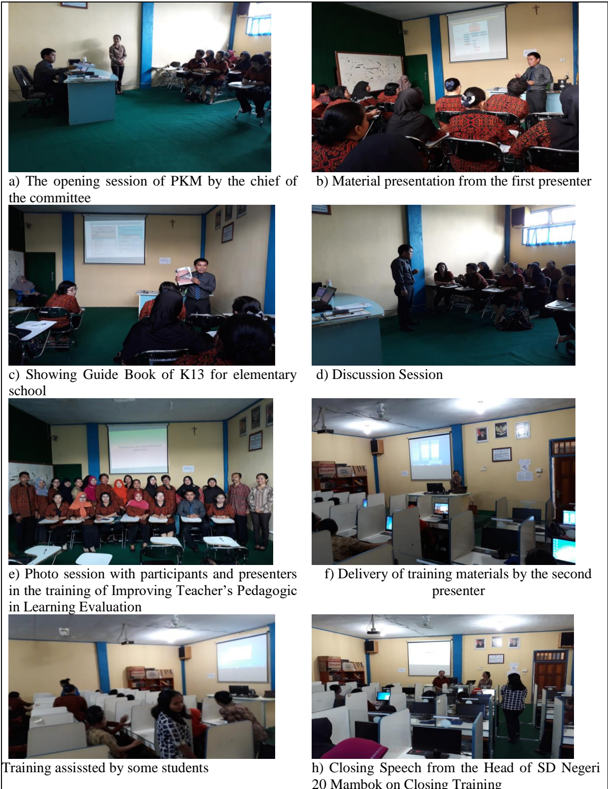
Fig. 3. Documentation during a training session

There were some activities done during the training starting from the opening up to its closing as can be seen from the documentation result below.