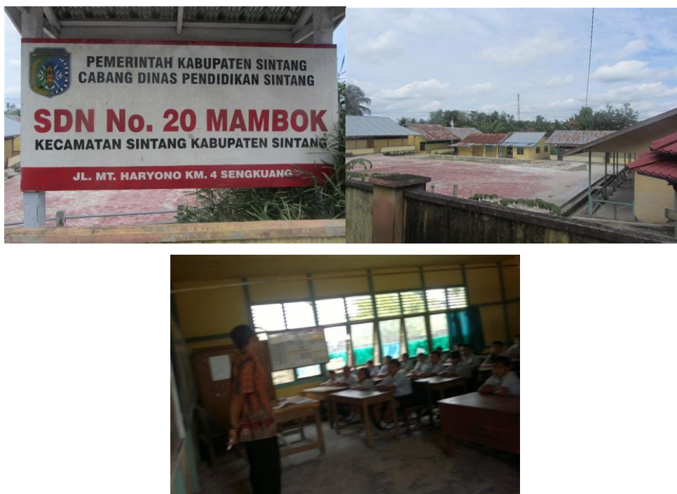
Fig. 1. The situation at SDN 20 Mambok, Sintang Regency

Throughout the years, the number of students in this school is increasing. The number of teachers in this school is 25 people with almost 90% being civil servants. Based on the interviews, it was found that rarely did the teachers get training or additional information for self-development in terms of learning evaluation. Therefore, the authors feel the need to raise the theme of this activity by selecting SDN 20 Mambok as the target partner.