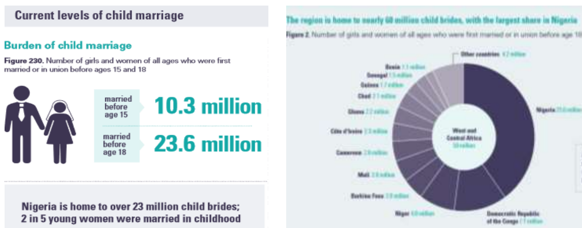
Fig. 2 Number of child marriages in Nigeria

Nigeria is a country of about 23.6 million perpetrators of child marriage also known as child brides according to UNICEF data calculated from 2010-2021. The Nigerian government has set a minimum age of marriage of 21 years and a special exception of 18 years, there are 10.3 million children married before the age of 15 years out of a total of 23.6 million children married before the age of 18 years (Philipose et al., 2022). However, poverty and socioeconomic backwardness are among the factors that influence the occurrence of child marriage practices and rural areas in Nigeria have the vulnerability of child marriage occurrence twice as bad and three times worse for areas with the poorest demographics (Syafira, 2020).